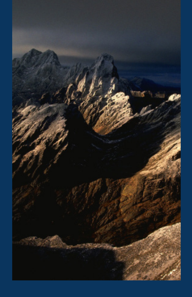
MARQUEST MUTUAL FUNDS INC. Explorer Series Fund